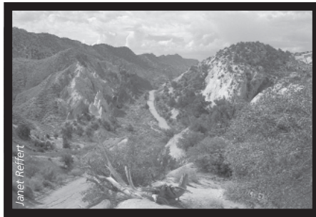
Cottonwood Canyon Road Scenic Backway

Excellent wildlife viewing opportunities for seeing pronghorn, deer, prairie dogs, and elk. Features: East Fork of the Sevier River, Tropic Reservoir, Great Western Trail, Dixie National Forest and King Creek Campground. Distance 17 miles one way (1-1/2 hours).