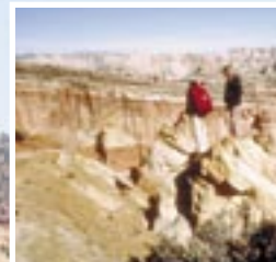
Hikers at the Waterpocket Fold

Before driving to Capitol Reef, stop in Boulder for information and services.