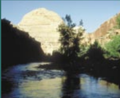
Capitol Dome